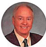
Senator Larry Liston ( /legislators/larry-liston )