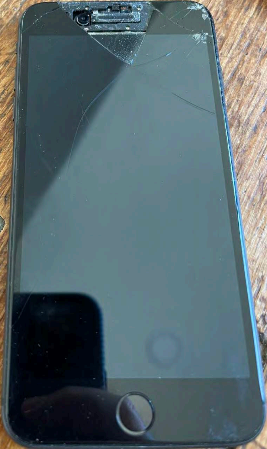
Exhibit PX 0115 FEC United