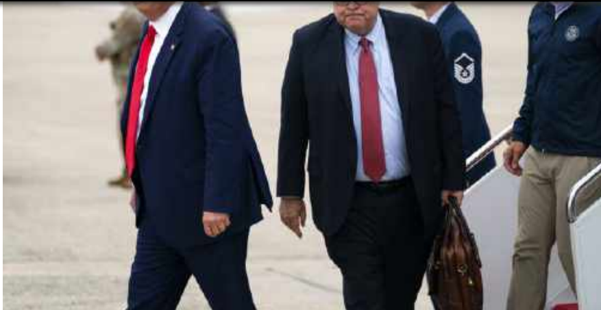
President Donald Trump, Attorney General William Barr and acting Homeland Security Secretary Chad Wolf arrive at Andrews Air Force Base after a trip to Kenosha, Wis., Tuesday, Sept. 1, 2020, at Andrews Air Force Base, Md.