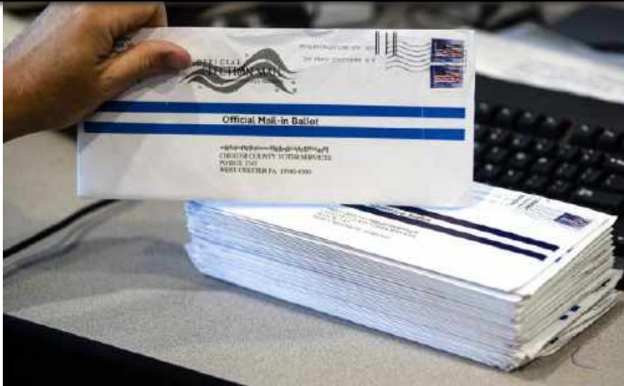
FILE – In this May 28, 2020, file photo, mail-in primary election ballots are processed at the Chester County Voter Services office in West Chester, Pa.