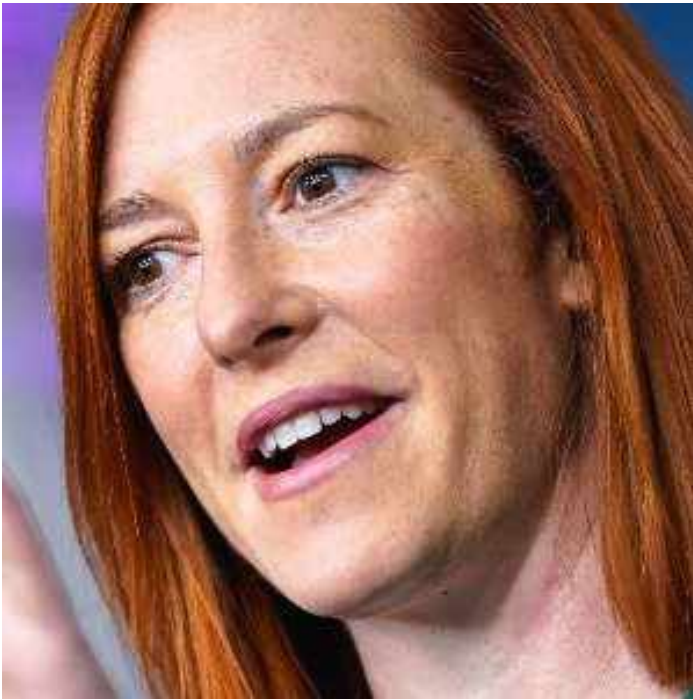
White House Press Sec. Reveals The Reason She's Stepping Down