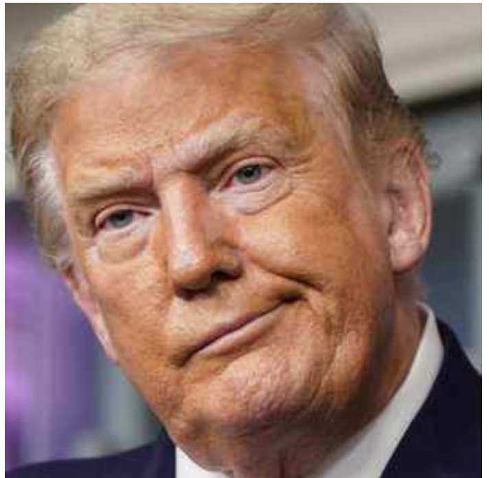
Now We Know Donald Trump's True Net Worth