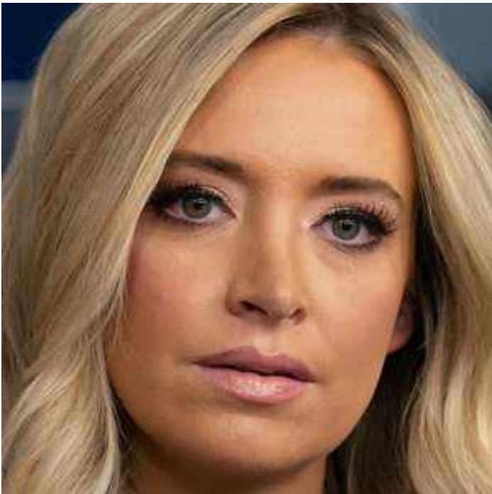
Kayleigh McEnany Announces Major Career Change