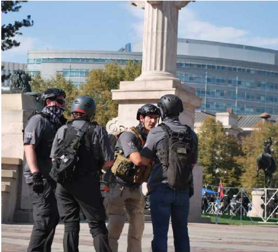
FEC United American Defense Force members at "Patriot Muster" event Saturday.

While FEC intends to organize in churches, schools and businesses, it was the "defense force" that was most visible on Saturday. According to the group's website , membership requires a background check and provides benefits including "insurance protection for use of force; discounts on ammunition; medical supplies; hard goods; soft goods; weapons, tactical, and CPR/ first aid training, as well as public safety notifications."