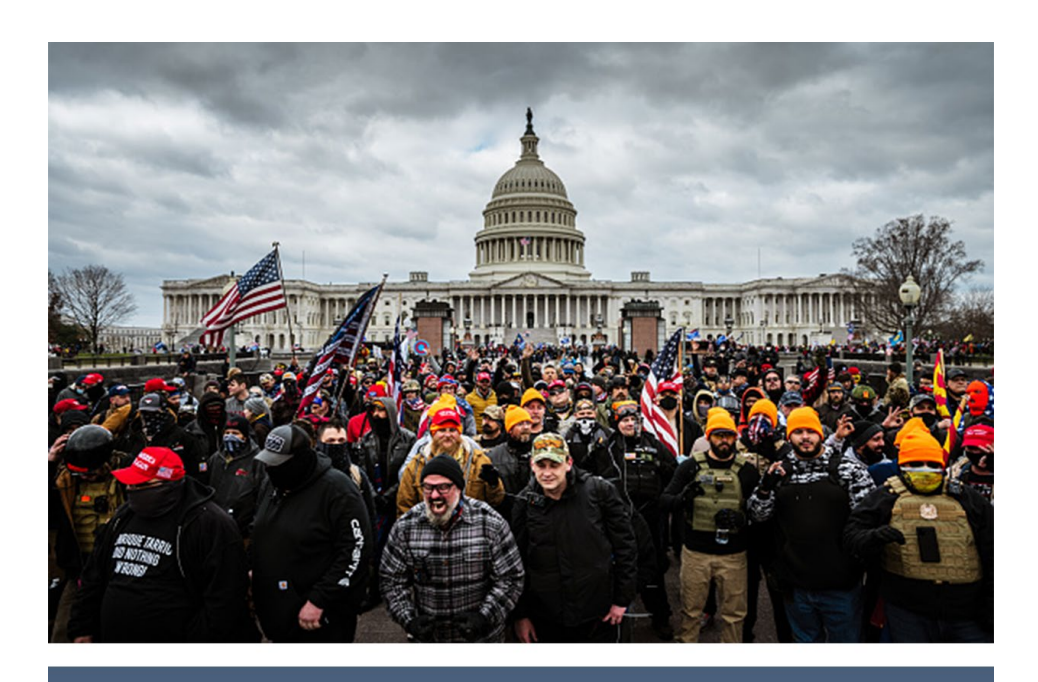
Proud Boys gather on the Capitol's East Front