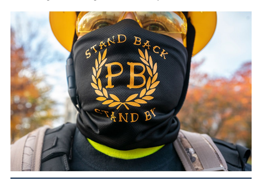
Nov. 7, 2020: Proud Boy wears a "stand back stand by" facemask

67. The Proud Boys quickly embraced Trump's "stand back and stand by" directive as a slogan and started selling merchandise with it that same night. Jan. 6th Report at 508. Tarrio, Biggs, and two other Proud Boys leaders were later convicted of seditious conspiracy to oppose by force the lawful transfer of presidential power on January 6th. <sup>49</sup>