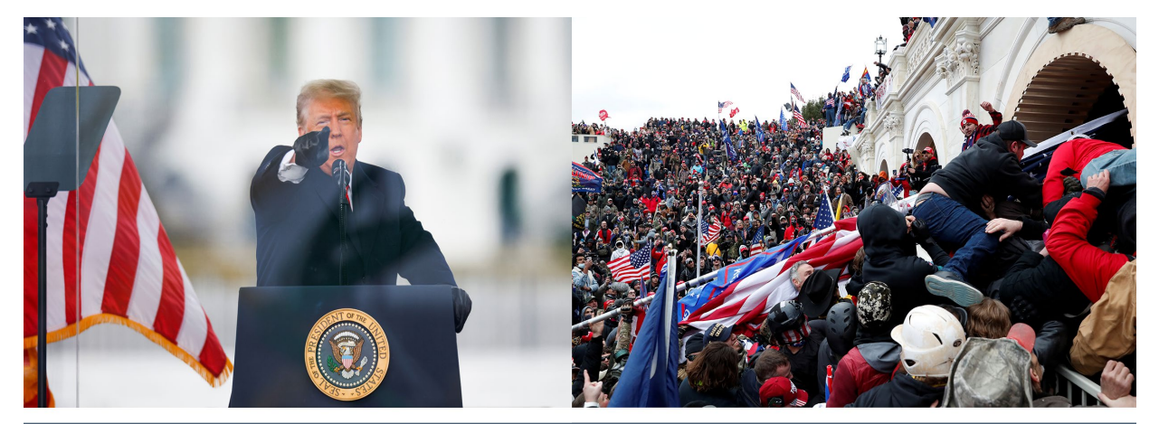
Trump addresses supporters before directing them to march on the Capitol